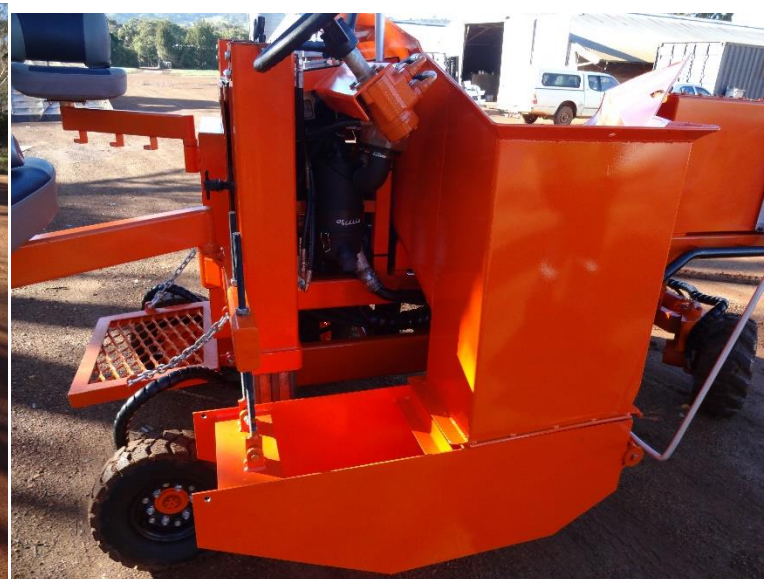
Hydraulic Kerbing Machine