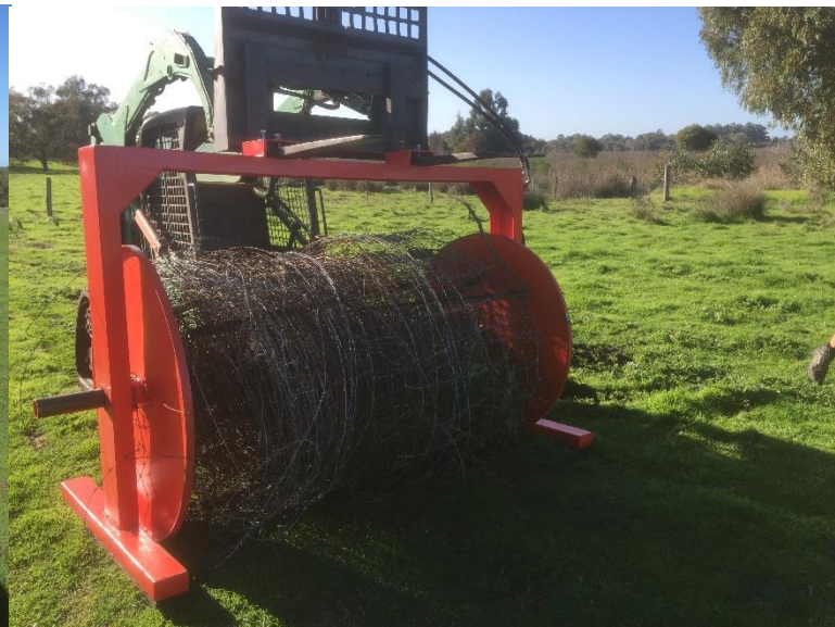
Hydraulic Fence Winder